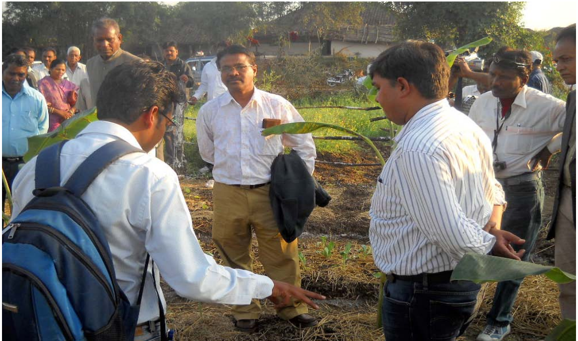
On a visit to Natueco model farm where a selection of grain and pulses are grown in Mandla