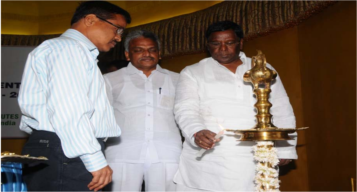
Honourable Union Minister of State for Planning and Parliamentary Affairs Shri Narayanasamy inaugurating the First National Convention of Rural Institutes – 2009 by lighting a lamp while NCRI Chairman Dr S V Prabhath and Puducherry Revenue and Tourism Minister Malladi Krishna Rao look on.