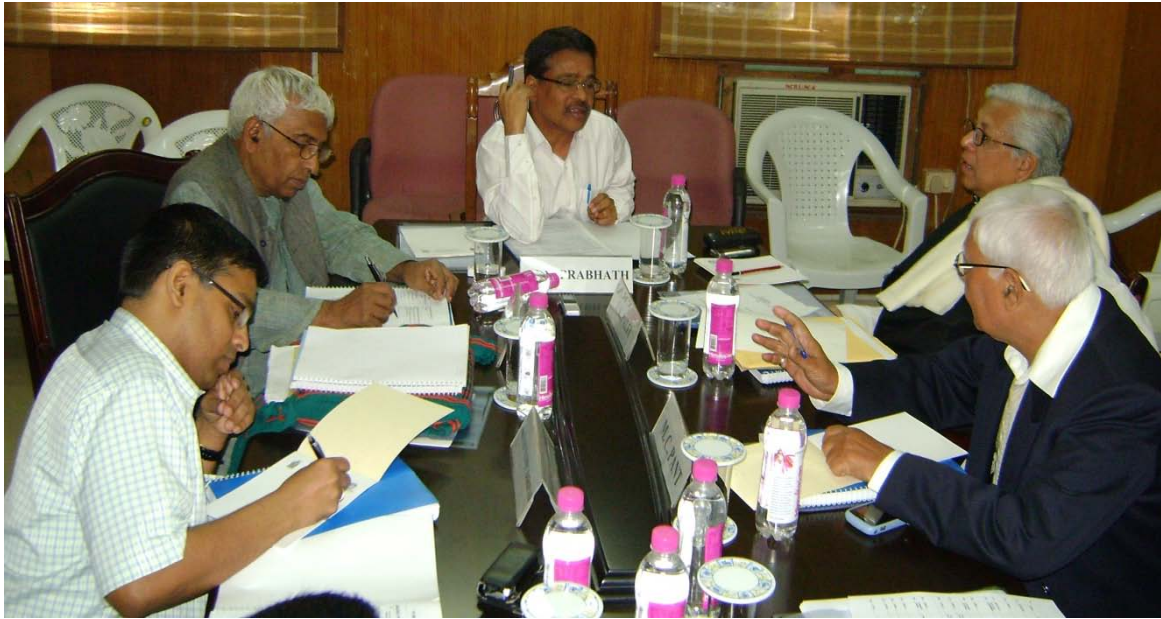
The second Standing Committee on Basic Education meeting in progress at the NCRI's office in Hyderabad on December 22, 2009