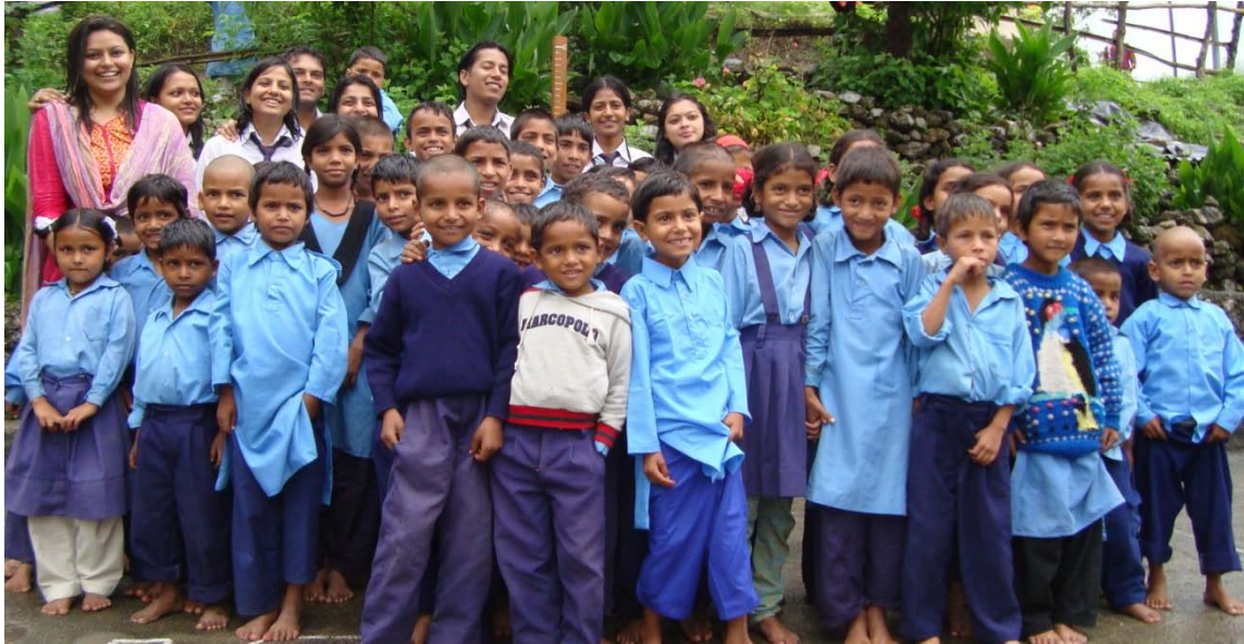
Children from SIDH school with GEU students